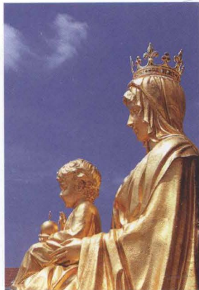
The Seat of Wisdom

The golden statue is an original interpretation of "Assumption." Christians venerate the mother of Christ as the seat of wisdom and as taught by St. Louis Marie de Montfort, Christ is the wisdom seated on the throne. The mother of Christ is the dwelling place of the supreme wisdom of all science. The university is the Alma Mater or our mother who is also the dwelling place of knowledge. In this context "Assumption," besides its religious connotation in the glorification of the mother of Christ, has yet another meaning in Thai language, "The Abode of Abiding Knowledge." Rightly, Assumption is the seat of wisdom.