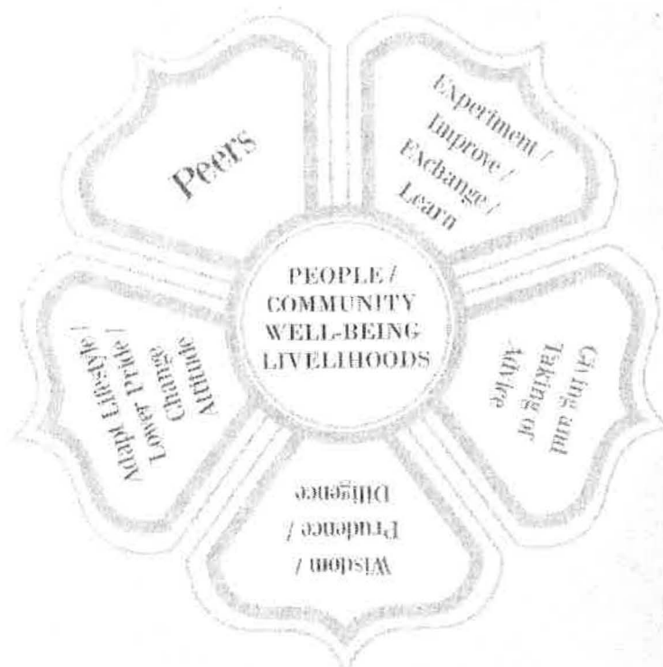
Diagram III : New theory Agriculture for Building a Learning Community