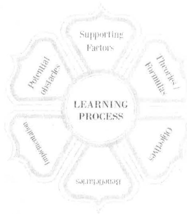
Diagram II : The Holistic Learning Process Based on New Theory Agriculture