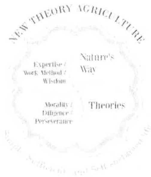
Diagram 1 : New Theory Agriculture Leading to a Free Life

Despite Thailand's emergence in recent years as a major trading economy in Asia, the King's encouragement of a self-reliant "sufficiency economy" has attracted support in the countryside. Government programs support village recycling and low-carbon impact agricultural practices. A number of villages are moving away from chemical fertilizers for environmental reasons, confident they have found comparable organic alternatives. In some parts of Thailand, sufficiency economy tourism is a growing phenomenon, with villagers eager to teach, and learn, about the best ways to increase garden production and introduce bio-fuel alternatives. Some believe that a more robust, self-reliant and simple rural economy can absorb redundant labor from factories closed by the economic recession.