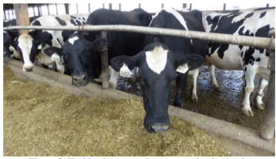
Figure 5: Healthy dairy cows increase production levels

The Independent Milk Research Agency monitors 85,000 dairy herds across Canada. Each month every farm is visited for the purpose of gathering samples and recording production rates for the herd. Dairy production statics support research and quality control and are accessible in both provincial and national data bases that are both current and comprehensive. Information figures document readings submitted for milk production for each herd according to set criteria related to, udder health, age at first calving, the longevity of the herd, calving interval in terms of the number of pregnancies for each cow, and the rate of herd turnover. Each herd then is ranked against the above criteria. The Joe Loewith and Son's Ltd. operation has consistently ranked in third place within this national scale. Carl states that this level of achievement is based on his family's dedication to dairy production. The current standard of excellence achieved at this farm is in fact, a reflection of three generations of commitment towards improvement in dairy farming methods. He credits not only the team approach of his family partners but also the importance of community-based experts, publications, and networks that support advancement within the diary production industry. Gone are the days when dairy farmers are problem-solving in isolation (Ontario, Milk Marketing Board, 2016). The advent of the Internet and applications of smart farming technology