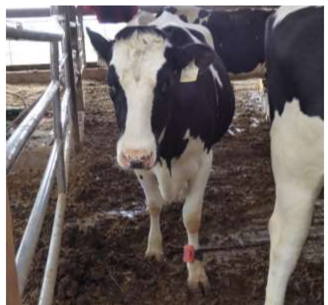
Figure 1: A cow with digital bracelet