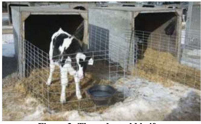
Figure 3: Three days old heifer

Advances in genetic science and technology have made it possible for dairy farmers to map the genome of a Holstein calf as early as one day after its birth. A sample of hair or blood can be used to isolate components of the calf's Deoxyribonucleic Acid (DNA). The process allows the farmer to predict with certainty how a heifer will mature to adulthood. Previously a waiting period of two years was necessary before a heifer could be assessed for its milk producing and breeding capacity. Applications of DNA testing provide firm indicators regarding the cow's future fertility, milk production levels, vulnerability to diseases and indicate the components of its milk such as percentages of buttermilk fat, protein, and lactose levels. The practice of artificial insemination of dairy cows added to the capacity to alter and select the structure of the DNA of males has far reaching implications to the quality of offspring. DNA testing has improved the effectiveness of the dairy cattle breeding process. Healthier more productive cows produce higher quality milk which affects operating costs and overall profitability.