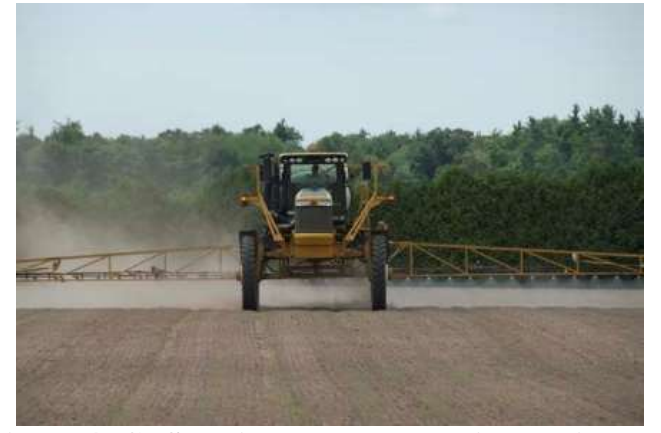
Sensor Driven Crop Management

be available. Dystocia obstructed labour in cattle occurs when the calf cannot pass through the birth canal (Patterson, Bellows, Burfening, & Carr, 1987). The mother and calf become at risk to injury or possible death if assistance from a veterinarian or knowledgeable individual is not immediately made available. Studies conducted by the experts have shown that dystocia is responsible for 33 per cent of all calf losses in the United States. The prevalence of dystocia understandably has serious economic implications for the dairy producing industry. The losses to a farmer of an adult cow or calf are considerable when factored against projected milk production and breeding figures over the animal's lifetime. Veterinary costs to treat injury or death of either the mother or her calf can be greatly reduced when assistance during the calving process is timely. Smart technology allows large herds to be monitored so that where more than one cow is calving at the same time resources can be in place to ensure the safe delivery of each calf.