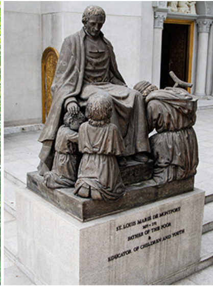
In front of the Chapel of St. Louis Marie de Montfort, Suvannabhumi Campus