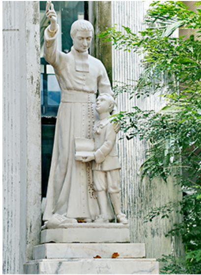
Located behind St. Philip & Bernard Hall (P Building), Hua Mak Campus