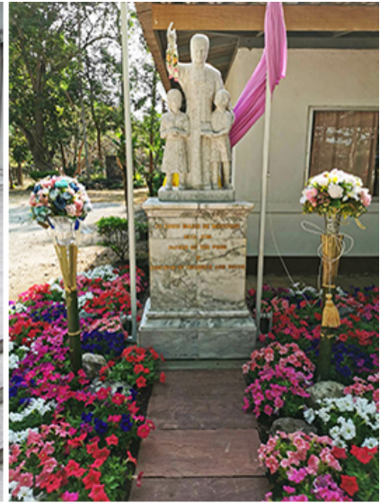
Located at AU Learning Centre Chalermphrakiat, Kanchanaburi province