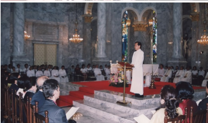
The annual celebration of the Chapel of St. Louis Marie de Montfort 2003