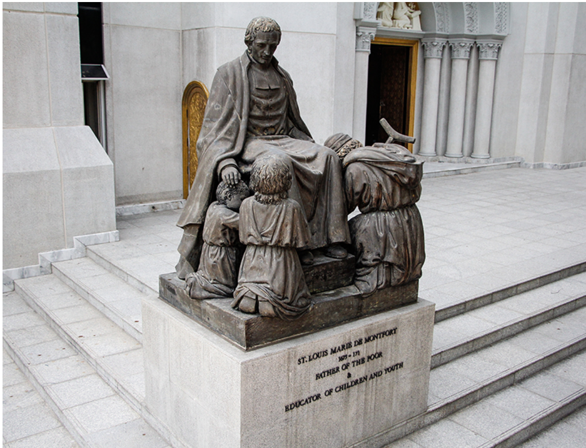
St. Louis Marie Grignon de Montfort (1673-1716) The Founder of Brothers of Saint Gabriel Father of the Poor & Educator of Children and Youth